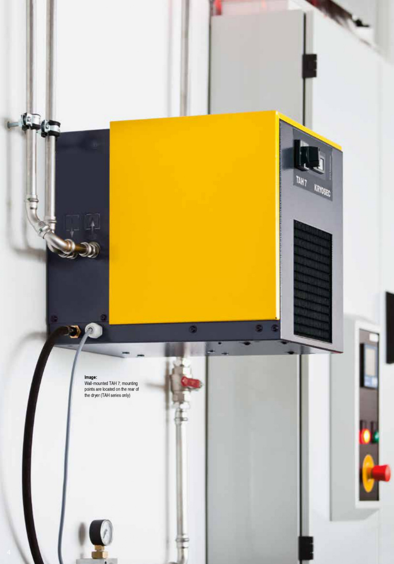
Image: Wall-mounted TAH 7; mounting points are located on the rear of the dryer (TAH series only)