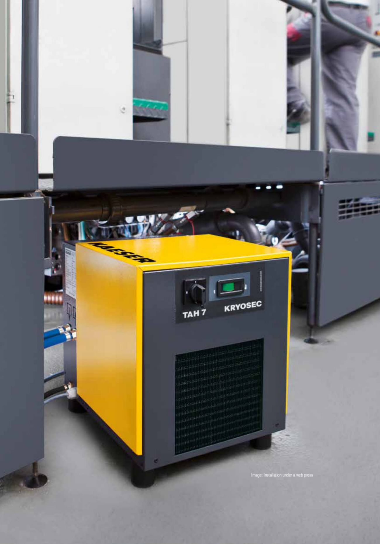
Image: Installation under a web press